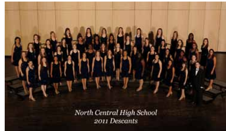
North Central High School 2011 Descants